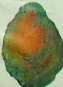
Plate XXIV. Healthy Blood Corpuscle.