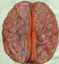
Plate V. Healthy brain.