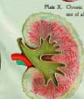
Plate XVI. Fatty Degeneration and enlargement of Kidney.