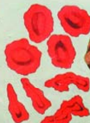
Plate XXV. Blood Corpuscles destroyed by alcohol.