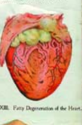
Plate XIII. Fatty Degeneration of the Heart.