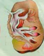
Plate XV. Contracted or "Spirit Kidney."