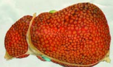
Plate VIII. Contracted or "hob-nail" liver. Cause—Continuous use of Alcohol.