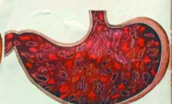
Stomach Showing Last stages of Delirium Tremens.