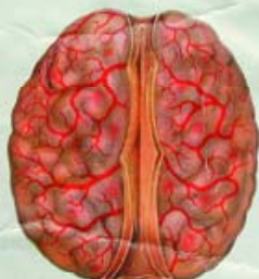
Plate VI. Effects of alcohol upon brain.