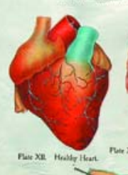
Plate XII. Healthy Heart.