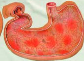
Plate II. A stomach after ten or fifteen days continuous drinking.