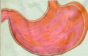
Plate I. A healthy stomach.