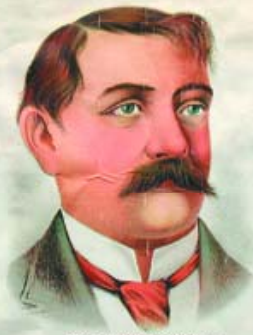
The moderate drinker.