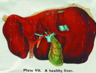
Plate VII. A healthy liver.