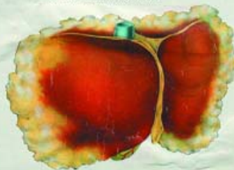
Plate XI. Fatty degeneration and enlargement of Liver. Cause—Too much alcohol.