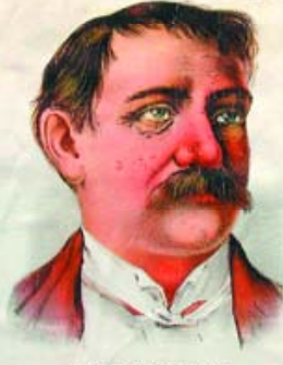
The chronic drunkard.