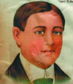
Plate XXII. An Emaciated Youth, whose blood is poisoned by 'A. C. P.' (Alcohol).