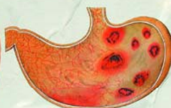
Plate III. Last stages of ulcerated stomach of chronic drunkard.