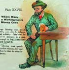
Plate XXVII. Whose Many a Workman's Money Goes.

The average drinking man spends about $100 a year for the habit. He has and he loses it. Why waste his money? He can get a man's strength in his own hands and his health in his own mind. The average drinking man spends about $100 a year for the habit. He has and he loses it. Why waste his money? He can get a man's strength in his own hands and his health in his own mind.