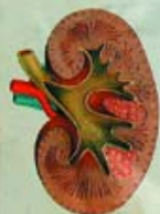
Plate XIV. Healthy Kidney.