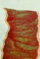
Plate XVIII. Inflammation of stomach, the result of use of alcohol.