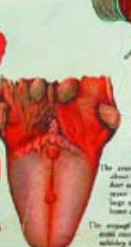
Plate XXVI. Tobacco Cancer caused by smoking.